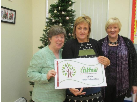
The Principal and staff at Cumber Claudy Primary School receiving their NIFSA Official Forest School Site plaque.

NIFSA also supported The Sunshine Nursery in Ballinderry this year. Six staff are being trained as Forest School Leaders. They have leased a small plot of land directly opposite from the nursery building and parents and volunteers helped develop a corner of a field into a wonderful magical Gruffalo Wood.