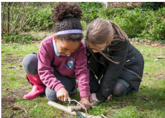
Above: Morton Community Association kids at Marlborough Park in Belfast

NIFSA finished the last two schools under the Faughan Valley Landscape Partnership Scheme. This was funded for a five-year period by the Heritage Lottery Fund. Cumber Claudy Primary School and Mullabuoy Primary School. Well done to both schools who are both still running forest school sessions with their pupils.