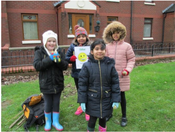
Above: Working with after-schools club at the Markets Community Centre in Belfast

We are working with Belfast City Council in some of their Community Centres in South Belfast – Sandy Row, Markets and Donegal Pass. This was all possible with funding from the Challenge Fund.