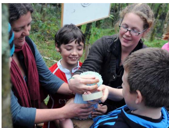
Learning outdoors together