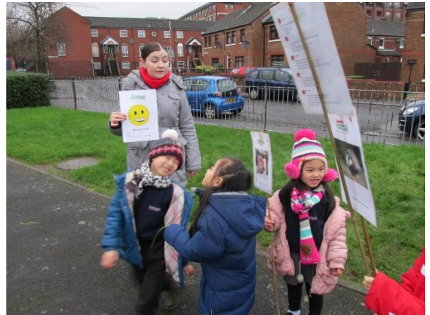
Above: Working with after-schools club at the Donegal Pass Community Centre in Belfast