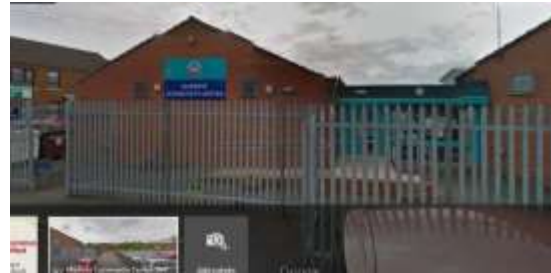
Markets area of South Belfast

In April of this year NIFSA applied to the Challenge Fund administered by the Northern Ireland Environment Agency for funding to support Forest School training for disadvantaged groups in Donegal Pass, Sandy Row and the Markets area of South Belfast. We were thrilled to here our application had been successful this month and we can begin delivering the Level 3 Forest School Leadership Award to Belfast City Council Support Workers and volunteers from these centres.