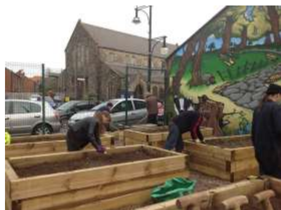
Green space outside Donegal Pass Community Centre