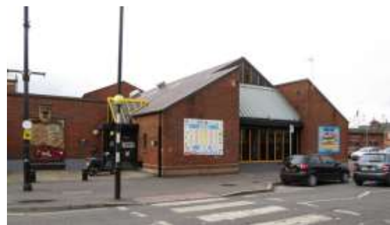
Sandy Row Community Centre