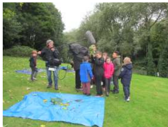
The BBC camera crew interviewing some of the pupils taking part in the Shared Education Forest School Project

Holy Family and Currie Primary Schools have seen the many benefits of taking part in a Shared Education Forest School Project. Both Principals now want to expand the Project and involve all of their Year Groups, not only the Year 5's. NIFSA is hoping to secure funding to work with each year group visiting Alexandra Park together at least twice a term. This would be a wonderful and sustainable example of a real Shared Education project, where the pupils have the opportunity to engage with each other in real life activities throughout their Primary School career.